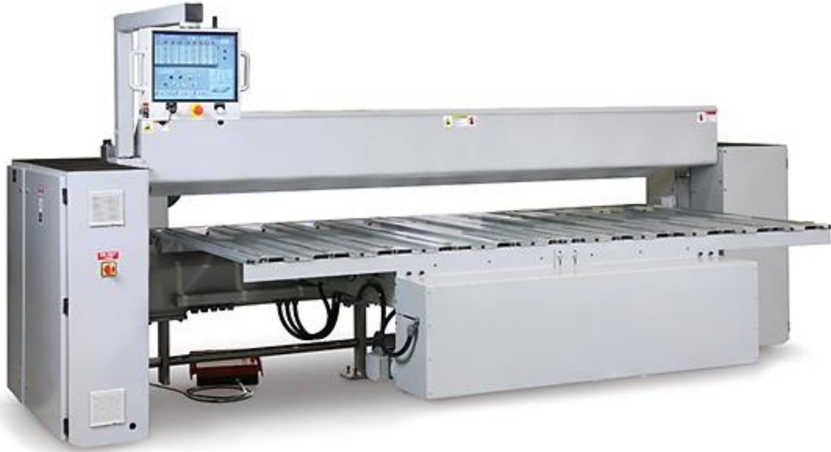
Rear view of the SBS